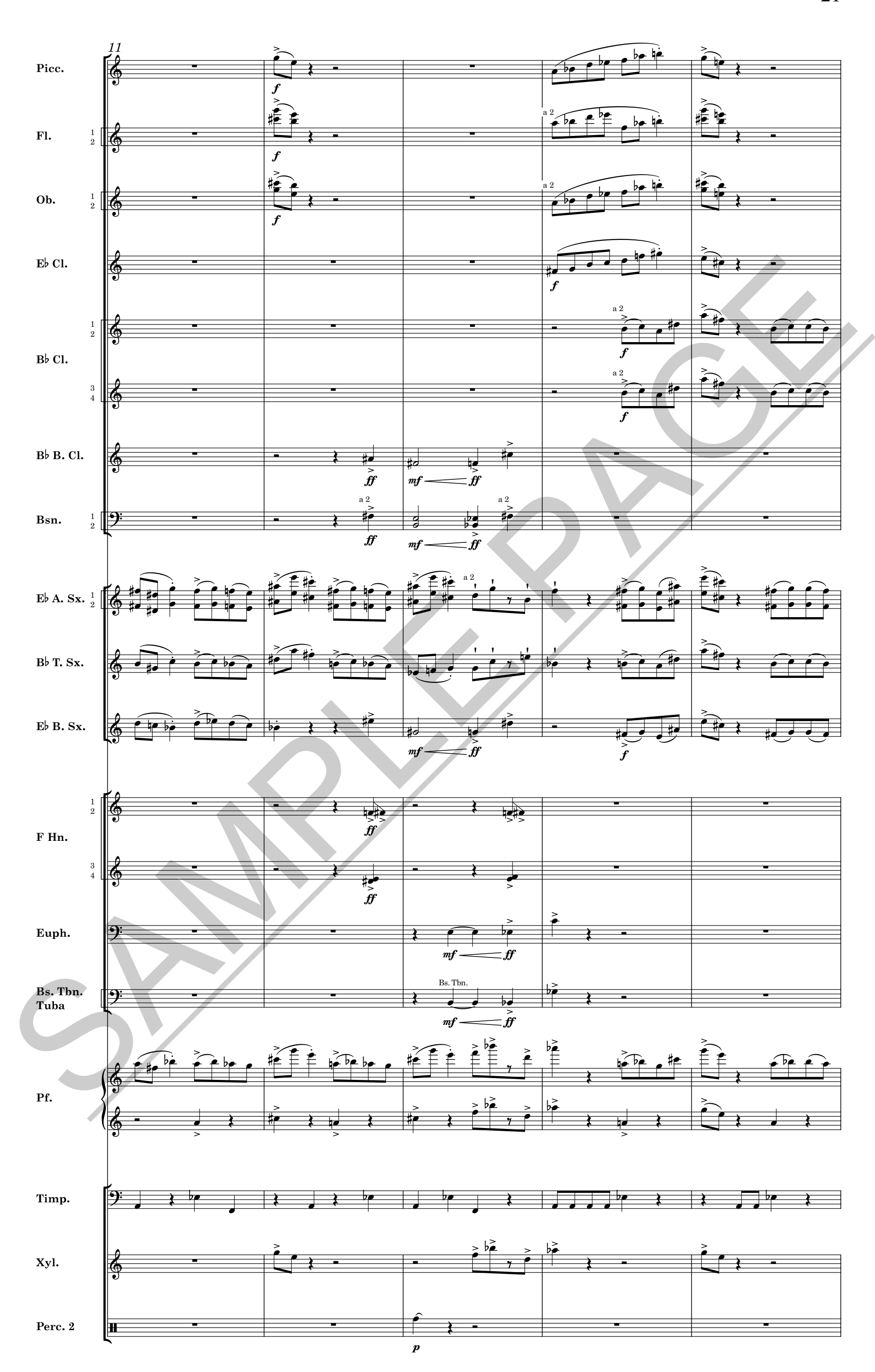
SAMPLE PAGE. UNAUTHORIZED USE PROHIBITED. AVAILABLE ON ZHOUTIANMUSIC.COM