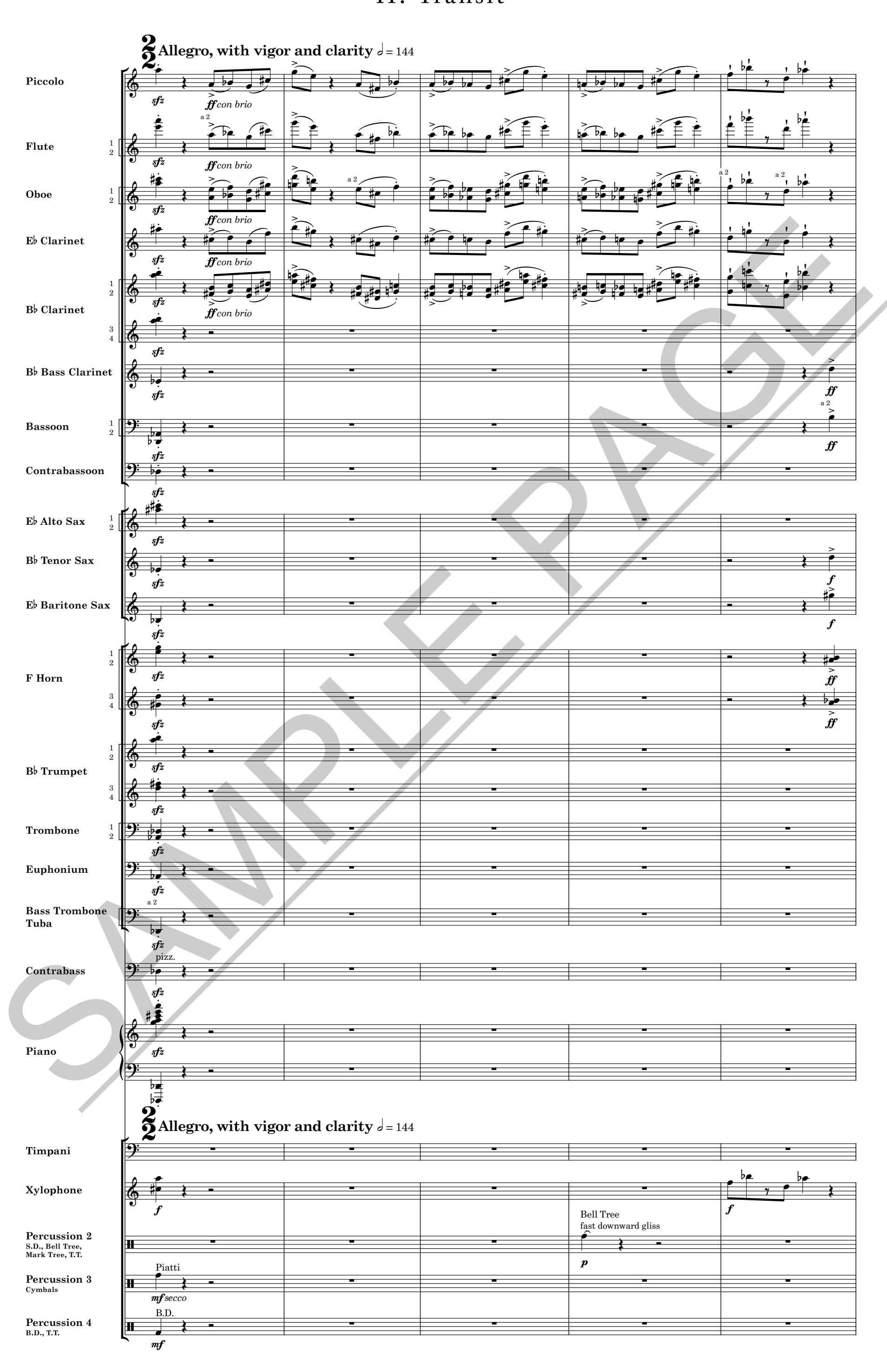
SAMPLE PAGE. UNAUTHORIZED USE PROHIBITED. AVAILABLE ON ZHOUTIANMUSIC.COM